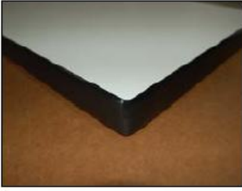
Standard Black T-Mold Edging