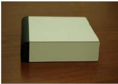
5008 Waterfall Edging on Front and Self Edging on Back and Side Edges