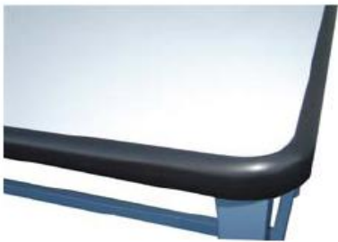
5008 Waterfall Edging on Four Sides