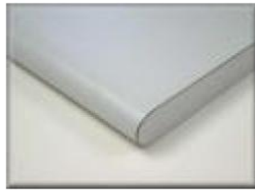
180 Degree Post Form Rolled Edging